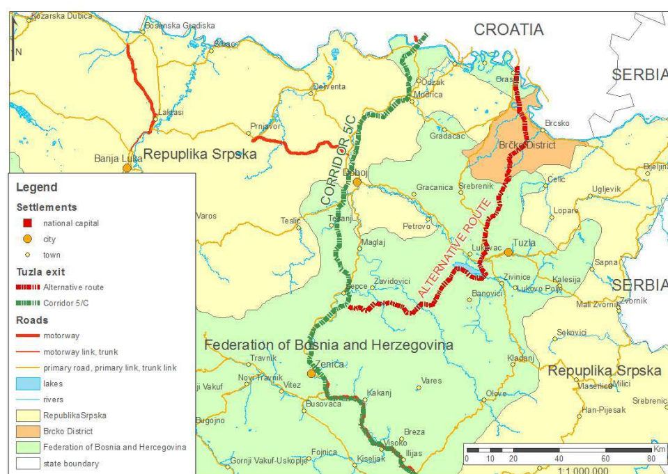
Figure 2. The “Tuzla exit”.

SOURCE: PROSTORNI PLAN FEDERACIJE BOSNE I HERCEGOVINE...; CARTOGRAPHY: SIMON B.