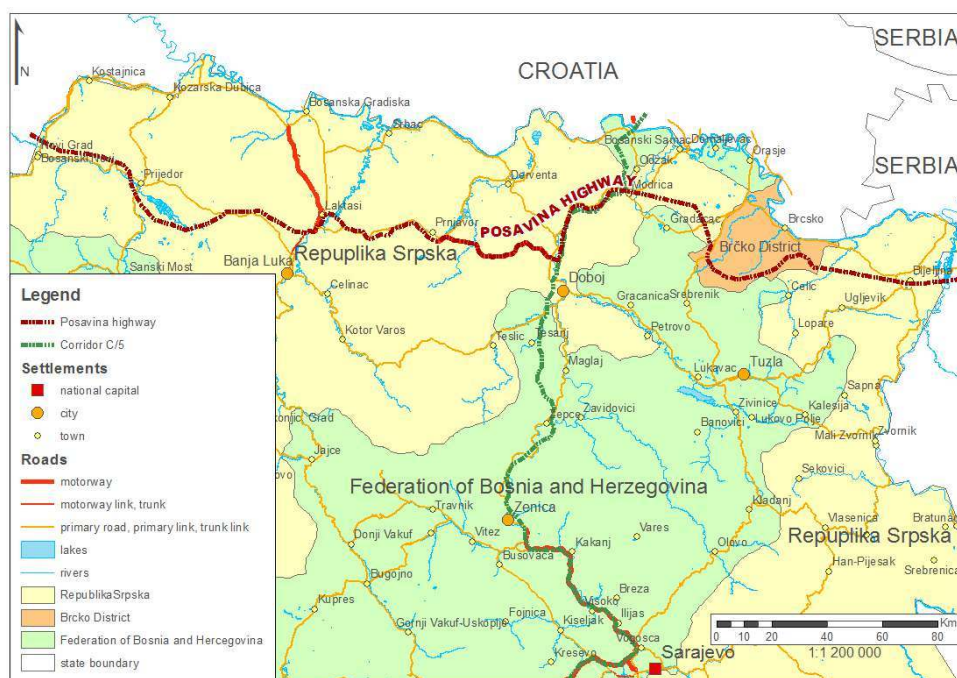
Figure 1. The “Posavina” corridor.

SOURCE: PROSTORNI PLAN REPUBLIKE SRPSKE DO 2015. GODINE; CARTOGRAPHY: SIMON B.