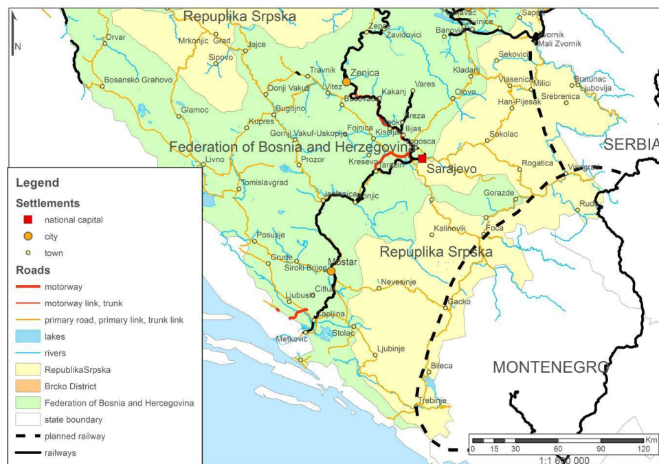
Figure 5. The railway development plans of the RS.

SOURCE: PROSTORNI PLAN REPUBLIKE SRPSKE DO 2015. GODINE; CARTOGRAPHY: SIMON B.