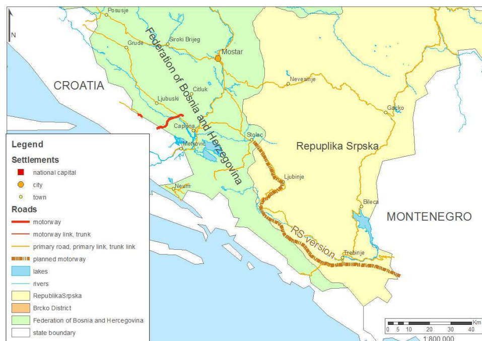
Figure 3. Eastern Herzegovina RS version.

CARTOGRAPHY: SIMON B.