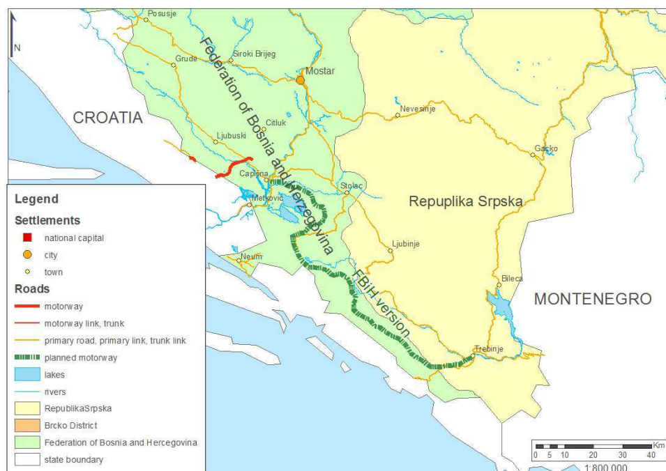
Figure 4. Eastern Herzegovina FBiH version.

SOURCE: PROSTORNI PLAN FEDERACIJE BOSNE I HERCEGOVINE...; CARTOGRAPHY: SIMON B.