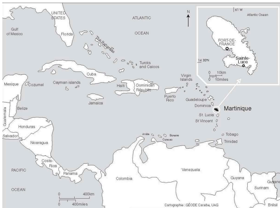
Figure 1. The Caribbean.